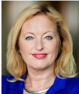
Dr Jet Bussemaker Former Minister for Research

Dr Bussemaker studied political science at the University of Amsterdam, and received her PhD on individualism and the welfare states, which was awarded best PhD in political science in 1993. She worked as lecturer and researcher at both the University of Amsterdam and the Vrije Universiteit Amsterdam between 1993 and 2007. In 1997 she was visiting fellow at the Center for European Studies at Harvard University. In the 1998 elections, Bussemaker was elected to the House of Representatives and served as State Secretary for Health, Welfare and Sports from 2007-2010. She returned to academic life as Dean of the University of Applied Sciences in Amsterdam. From 2012 until October 2017, she served as Minister of Education, Science and Culture.