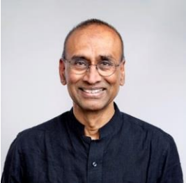
Prof Sir Venki Ramakrishnan Royal Society

Sir Venki is a Group Leader of the Medical Research Council Laboratory of Molecular Biology (LMB) in Cambridge and President of the Royal Society. On obtaining his PhD. in physics in 1976, he switched to molecular biology and after a long career in the USA he moved to Cambridge in 1999 to work at the LMB. He is best known for his work on ribosomes, the large molecules in all cells that read genetic information to make proteins. Ramakrishnan is a Fellow of the Royal Society, a member of EMBO, the US National Academy of Sciences, Leopoldina (the German Academy of Sciences) and a Foreign Member of the Indian National Science Academy. He received the Louis-Jeantet Prize for medicine in 2007 and shared the Nobel Prize for chemistry in 2009.